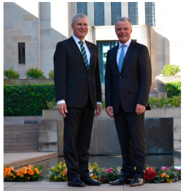
AT AWM: With The Hon. Dr Brendan Nelson, Director of the Australian War Memorial, the founder of which, Charles Bean, described in 1948: "Here is their spirit, in the heart of the land they loved; and here we guard the record which they themselves made."

Every Riverina community is deeply and eternally indebted to those who have served our nation and our region so well in all wars down through the