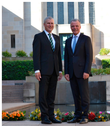
AT AWM: With The Hon. Dr Brendan Nelson, Director of the Australian War Memorial, the founder of which, Charles Bean, described in 1948: "Here is their spirit, in the heart of the land they loved; and here we guard the record which they themselves made."

South West Slopes towns and villages have contributed mightily to war