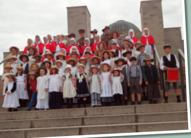
YOUNG VOICES: Combined choirs at the Australian War Memorial.

Its theme song, "Young and Free" is available on the kangaroomarch.org.au website and is also on iTunes with proceeds going to support the growth of the choir.