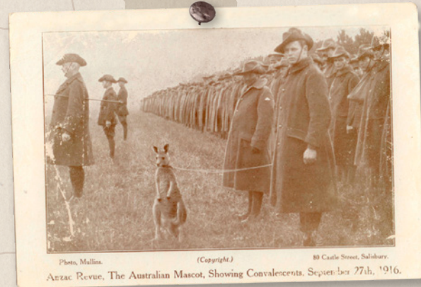
ALL IN LINE: ANZAC Convalescents with their kangaroo mascot at Salisbury, England, on 27 September 1916.