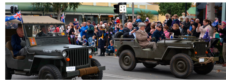
PARADE: One of the most pleasing aspects about recent ANZAC Day marches in Wagga Wagga is the increasing number of children in attendance.

There were public air-raid shelters but many families and most schools also had their own.