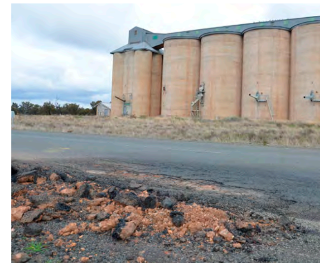
POTHoles: Ungarie Road near Calleen silos, midway between West Wyalong and Ungarie, is an example of the sad state of some Riverina roads.

Riverina farmers' valid concerns about the inadequate level of investment in country rail and the condition of regional roads has prompted me to write to the relevant Federal and State Ministers to make them aware of the situation ... in advance of this year's anticipated abundant harvest.