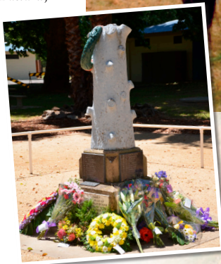
MONUMENT: Gundagai's unique Great War memorial in ANZAC Park is an obelisk shaped as a grey-painted tree stump with a green and red laurel wreath hooked over one of its branches sitting upon a concrete base with granite and marble name plaques attached to the base.