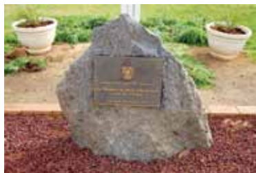
MONUMENT: The monument in Ungarie's RSL Park to honour all who served.

Everyone has different feelings about ANZAC Day. Mine is that we need to celebrate not that people died and the sadness of the war but that so many people sacrificed their lives and their braveness for my freedom.