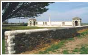
(Above) HISTORIC: The VC Corner Australian Cemetery and Memorial near Fromelles. (Top) CENOTAPH: Junee's Memorial Clock Tower. (Right) FOUND: HMAS Sydney.

Her courageous son is still yet to be positively identified ... he could well be among the as yet unidentified remains retrieved from Pheasant Wood.