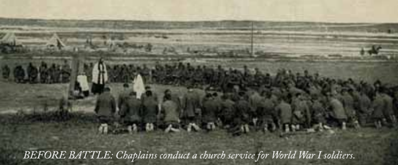
BEFORE BATTLE: Chaplains conduct a church service for World War I soldiers.