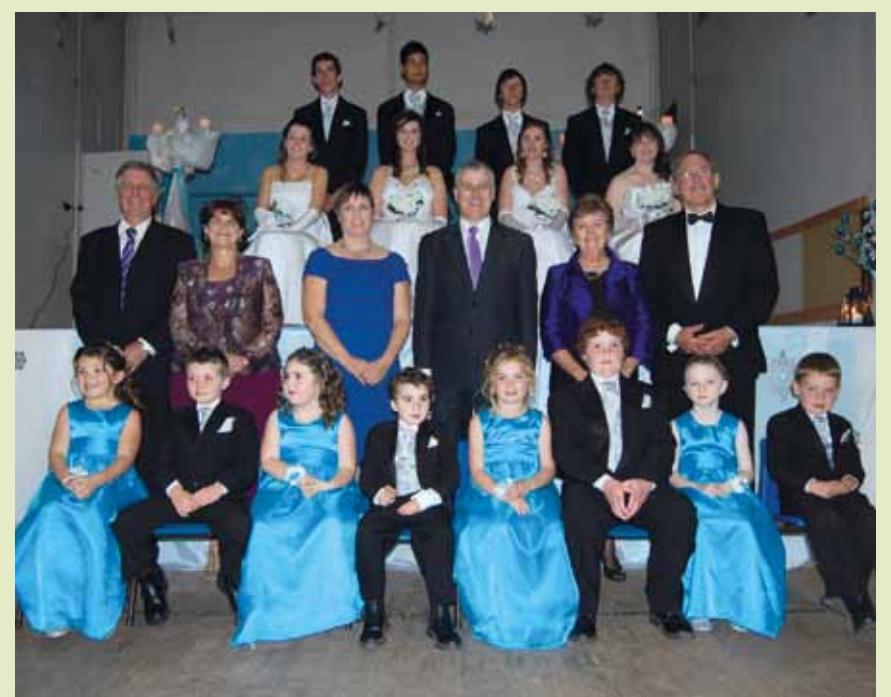
DELIGHTFUL DEBS: I had the pleasure of receiving the debutantes at the 11 June Weethalle Ball. It was a memorable evening with a wonderful turn-out from the district in the fabulously decorated Memorial Hall.

# Scheduled to be closed over next 2 years.