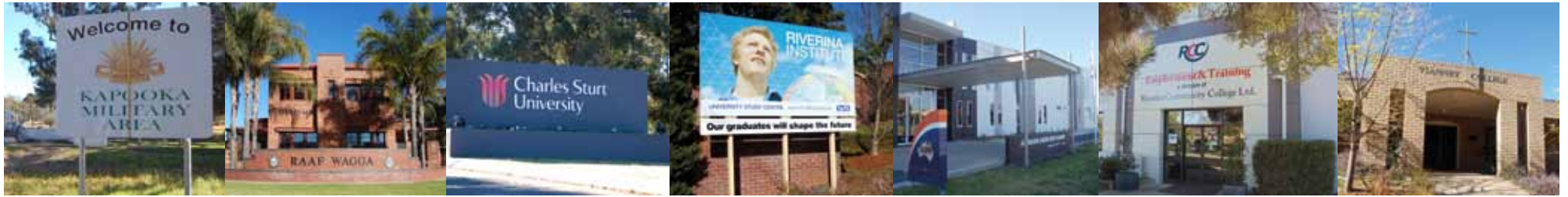
TRAINING EXCELLENCE: Some of Wagga Wagga's places of learning (from left) Kapooka Army base, Forest Hill Air Force base, Charles Sturt University, Wagga Wagga TAFE campus, REX Pilot Academy, Riverina Community College and Vianney College.