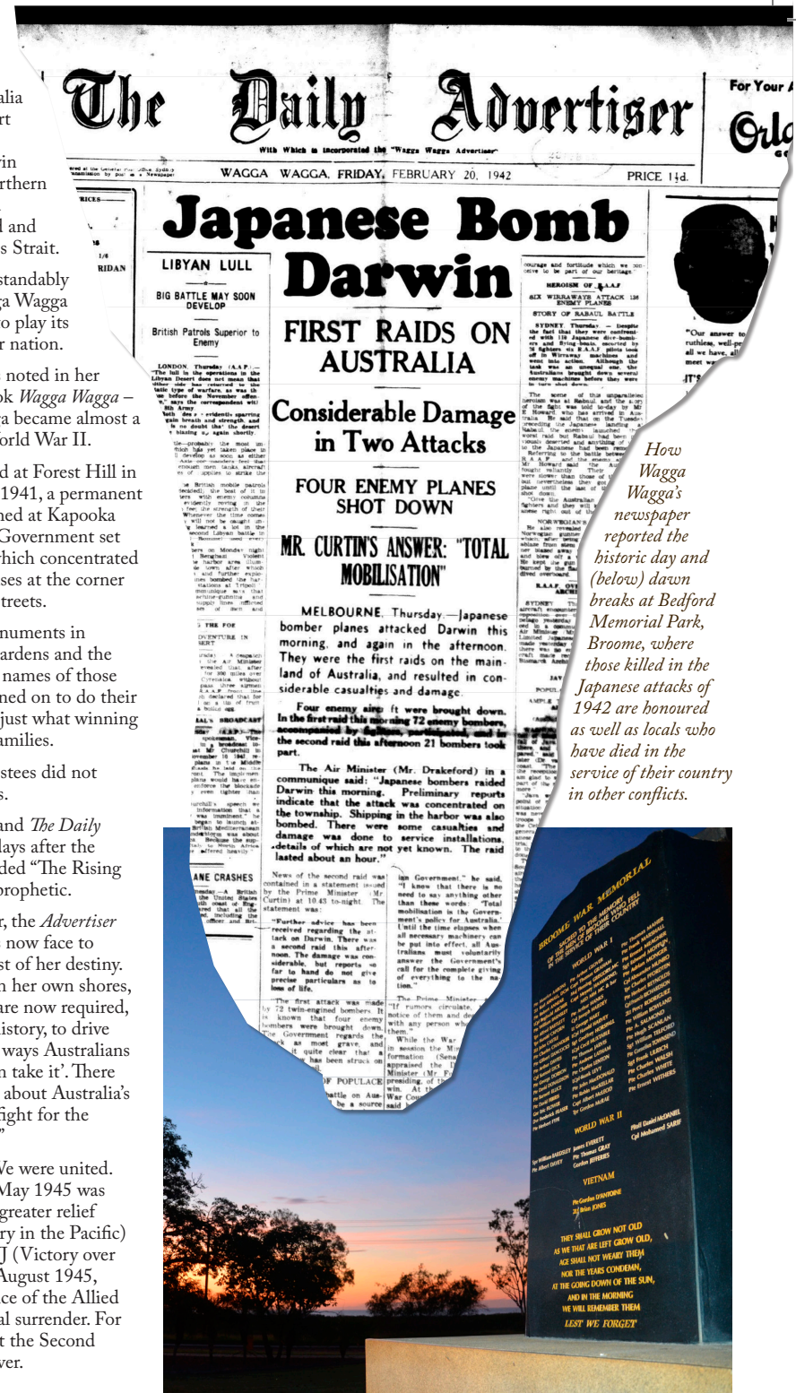
How Wagga Wagga's newspaper reported the historic day and (below) dawn breaks at Bedford Memorial Park, Broome, where those killed in the Japanese attacks of 1942 are honoured as well as locals who have died in the service of their country in other conflicts.