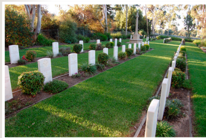
SUNRISE: Dawn breaks, shedding first light on the Memorial site of Kapooka's 1945 underground bunker tragedy and the wreaths placed there at the 2011 commemoration.