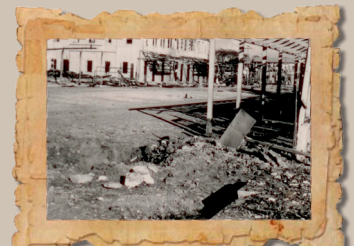
WAR ZONE: Many buildings were destroyed by the bombing raids.