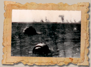
ATTACK: Darwin is pounded by Japanese fighter planes.