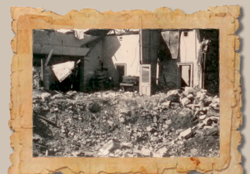
RUBBLE: A huge crater is about all which is left of the Postmaster's residence.