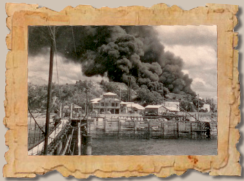
ABLAZE: Smoke billows skywards as oil tanks on Stokes Hill burn in this graphic original photograph of the Japanese bombing of Darwin.