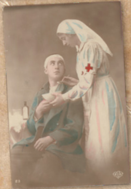
GOOD CARE: A nurse tends to a wounded soldier.