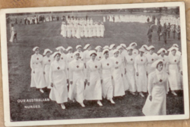
THE FINEST: A group of Australian war nurses.