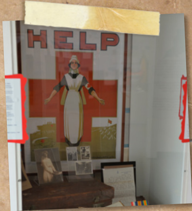
WORTH SEEING: Be sure not to miss the Museum of the Riverina's women in war exhibition.