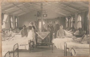
RECUPERATING: Diggers and nurses at Australia's WWI Harefield Hospital in London.