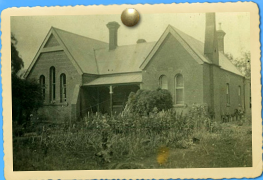
YESTERYEAR: Forest Hill Public as it was during the two World Wars. This building was demolished in 1949.