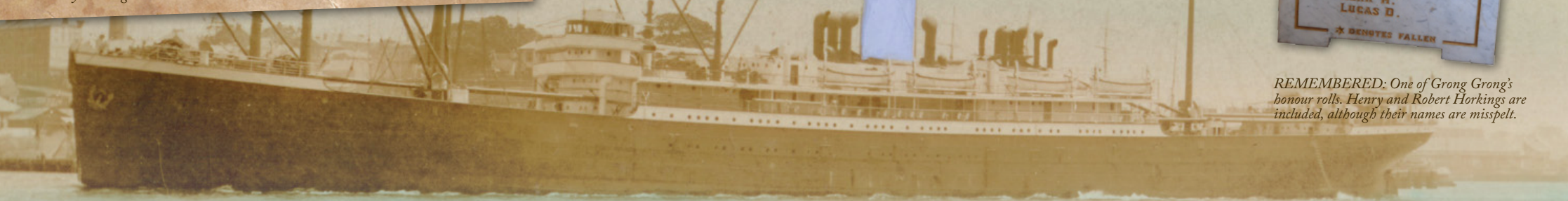
MAIN PICTURE: The 10,049-ton troopship HMAS Aeneas A60 which took Henry Horkings to war.