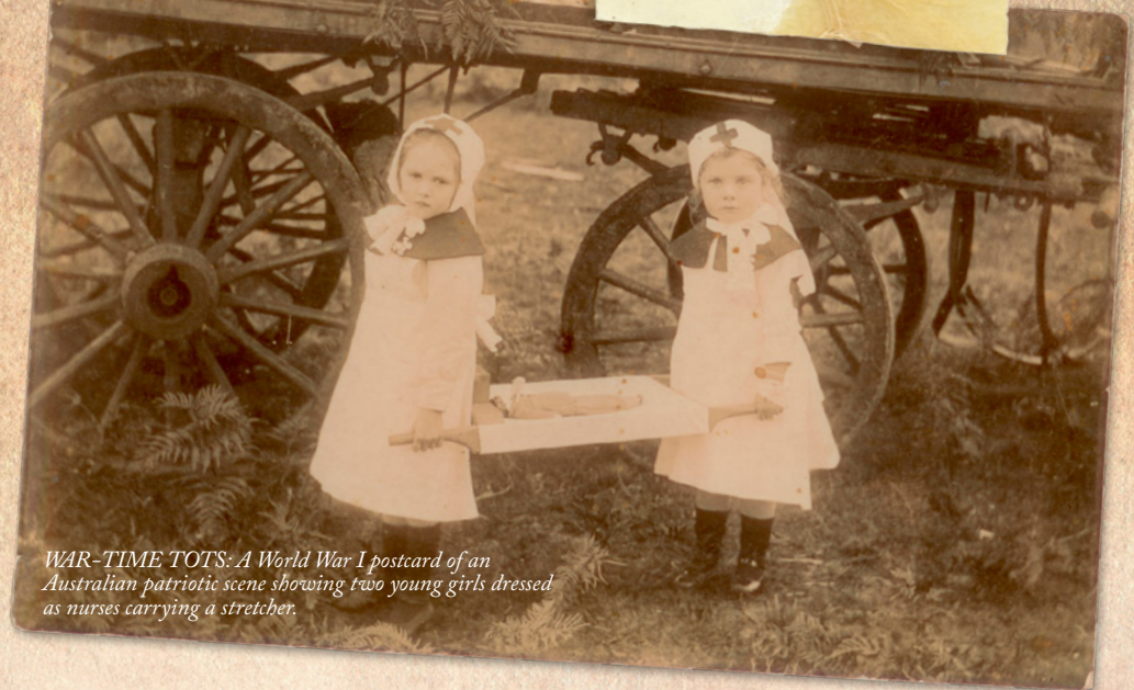
WAR-TIME TOTS: A World War I postcard of an Australian patriotic scene showing two young girls dressed as nurses carrying a stretcher.