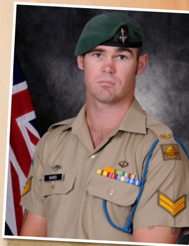
FITTING TRIBUTE: The memorial (below) at the Australian Defence Force domestic compound at Al Minbad Air Base in the United Arab Emirates, now officially known as Camp Baird, in memory of the gallant Corporal Cameron Stewart Baird VC MG (pictured above).