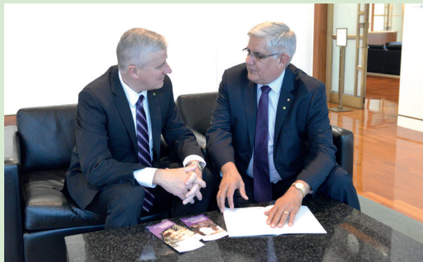
BETTER CARE: With Minister for Aged Care Ken Wyatt AM.

The measures we are taking in the aged care sector means an improved quality of care which respects the dignity of older Australians and supports their independence.