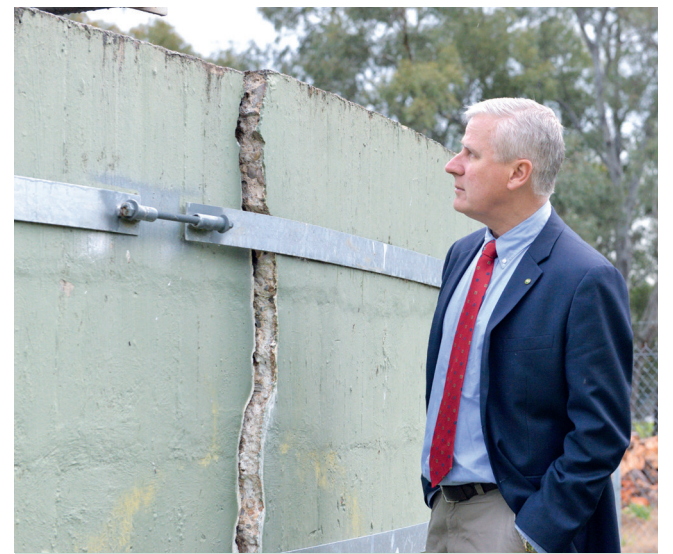
BADLY NEEDED: Inspecting the state of the current infrastructure at Gundagai's sewage treatment plant. Funding of $3.5 million has been secured for Cootamundra-Gundagai Regional Council towards building a new plant.