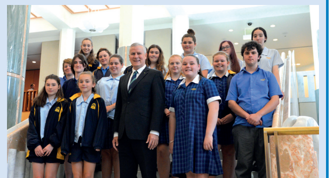
MARBLE LESSON: With Gundagai High School students during their visit to Parliament House.

This initiative will ease this pressure.