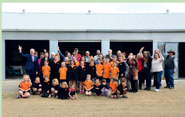
OPENING DOORS: At the opening of Nangus Hall's roller door project in which I secured $5,400 towards its completion.

I encourage locals to start thinking about potential applications. If you have a group or a public facility which needs an upgrade, or which can help boost tourism, local volunteerism or build a stronger local community, please have a look at the criteria and share your idea. My office will advise when applications open.