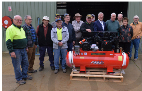
AIR APPARENT: With members of Wagga Wagga Men's Shed, which received $3,750 to buy new equipment, including an air compressor.