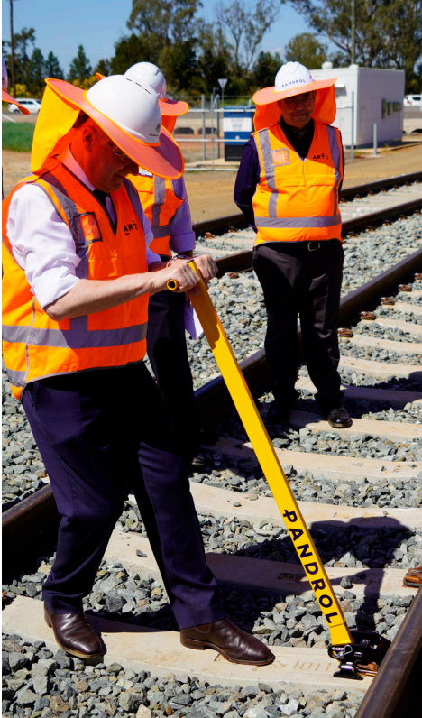
MOMENTOUS: Putting the final pin in place at Peak Hill to mark the completion of the Parkes to Narromine section of the Inland Rail. INSET: The gold commemorative pin.

OF course, one of the Federal Government's biggest infrastructure projects is Inland Rail, which is delivering jobs and investment in regional Australia when we need it most.