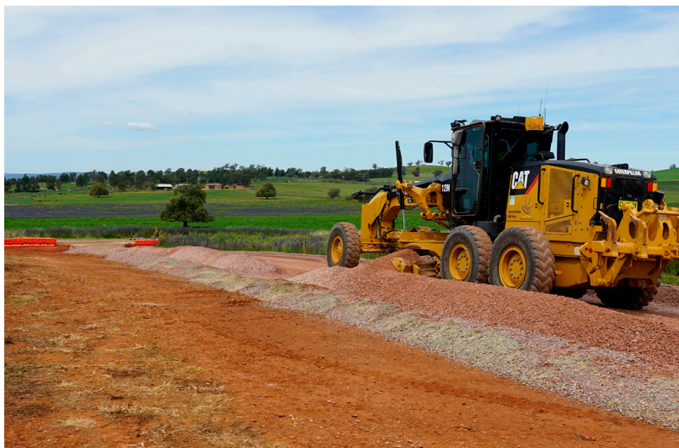
GETTING ON WITH THE JOB: Early works have already started for the Parkes bypass on Nock Road, just north of the town.

The Parkes Bypass is great news for locals, for businesses and for the future of the region, with many communities, farmers and businesses across the Central West, Murrumbidgee Irrigation Area and western NSW relying on the highway to get their products to shelves, remain connected to jobs and vital services, such as health, and