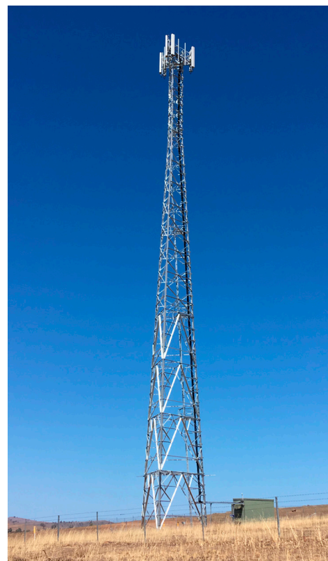
DELIVERING: The Nationals have helped to deliver more than 880 base stations across the country through the Mobile Black Spot Program, including this one at Wantabadgery.

The network investment plan includes $3.5 billion to make NBN Co’s highest wholesale speed tiers available, on demand, to up to 75 per cent of homes and businesses on the fixed-line network by 2023. Additionally, NBN Co will invest $700 million to enable nine in 10 businesses to order high-speed fibre broadband at no upfront cost as NBN Co rolls out 240 Business Fibre Zones across Australia, 85 of which will be located in the regions, including at Wagga Wagga.