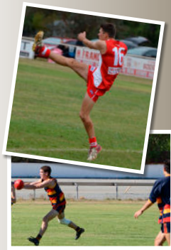
RIVALRY: A local derby with Griffith Swans hosting Leeton-Whitton Crows with a solemn ANZAC Day remembrance before the seniors will be held on ANZAC Day.