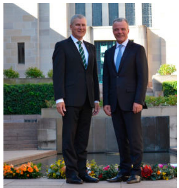
AT AWM: With The Hon. Dr Brendan Nelson, Director of the Australian War Memorial, the founder of which, Charles Bean, described in 1948: "Here is their spirit, in the heart of the land they loved; and here we guard the record which they themselves made."

Every Riverina community is deeply and eternally indebted to those who have served our nation and our region so well in all wars down through the