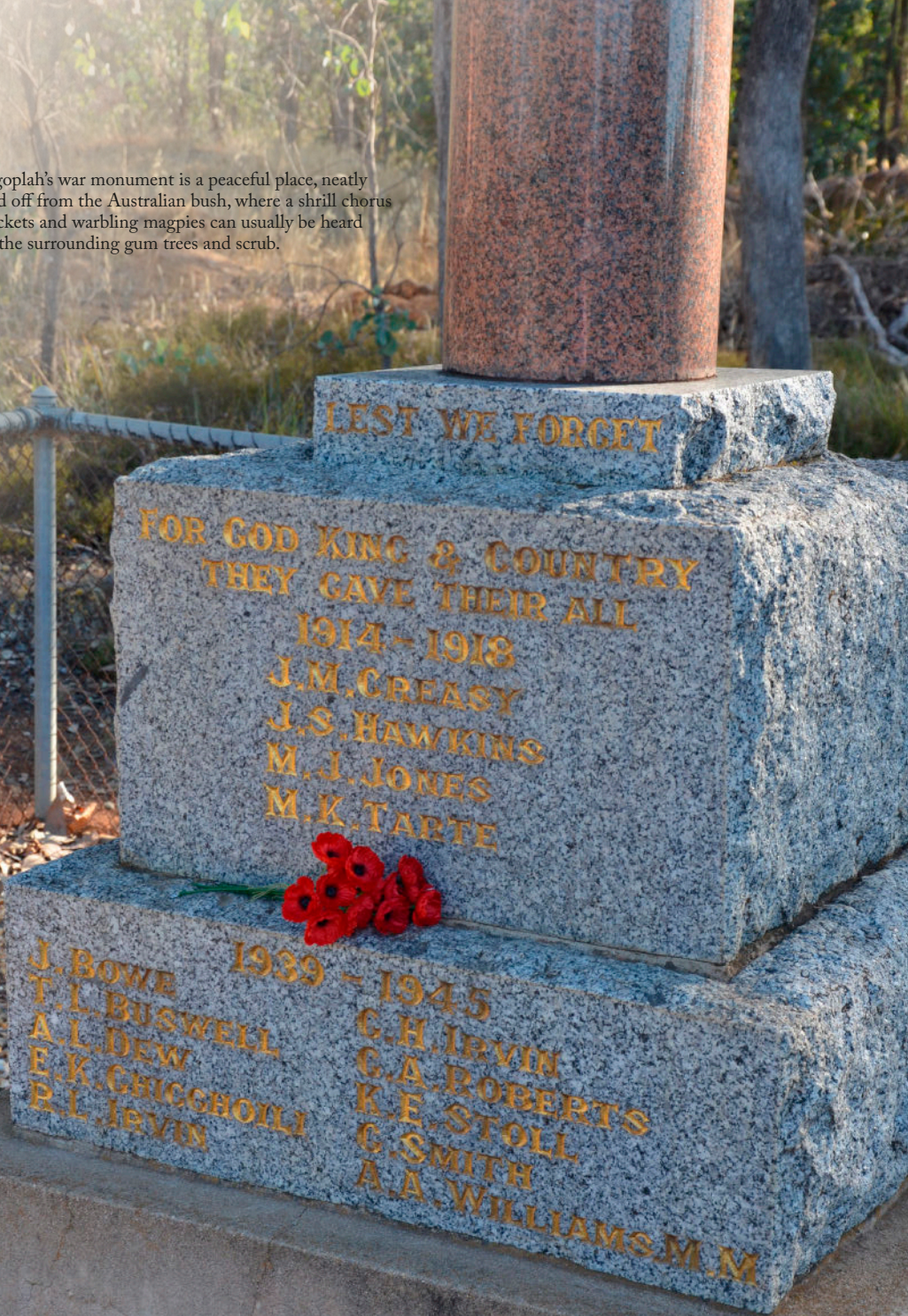
HOME AMONG THE GUM TREES: Mangoplah's main street war memorial.

Mangoplah's war monument is a peaceful place, neatly fenced off from the Australian bush, where a shrill chorus of crickets and warbling magpies can usually be heard from the surrounding gum trees and scrub.