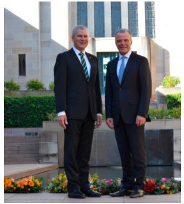
AT AWM: With The Hon. Dr Brendan Nelson, Director of the Australian War Memorial, the founder of which, Charles Bean, described in 1948: "Here is their spirit, in the heart of the land they loved; and here we guard the record which they themselves made."

Each local community has people who have given mightily - some with their lives - fighting for what was seen as just and right.