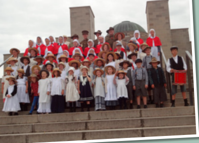
YOUNG VOICES: Combined choirs at the Australian War Memorial.

Its theme song, "Young and Free" is available on the kangaroomarch.org.au website and is also on iTunes with proceeds going to support the growth of the choir.