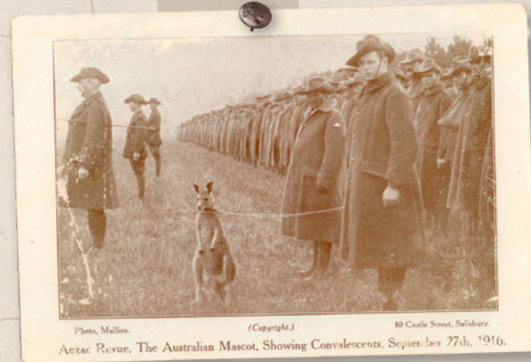
ALL IN LINE: ANZAC Convalescents with their kangaroo mascot at Salisbury, England, on 27 September 1916.