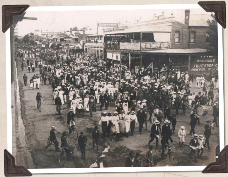
STARTING OFF: The Kangaroos march along Fitzmaurice Street just past the Kincaid Street corner on 1 December 1915.