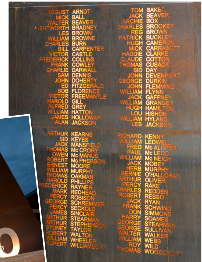
LEST WE FORGET: The illuminated names of the 88 Kangaroos.