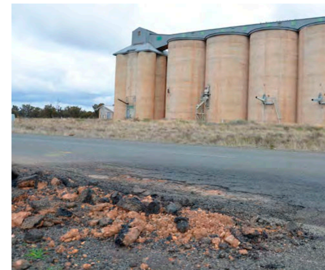
POTHOLES: Ungarie Road near Calleen silos, midway between West Wyalong and Ungarie, is an example of the sad state of some Riverina roads.

Riverina farmers' valid concerns about the inadequate level of investment in country rail and the condition of regional roads has prompted me to write to the relevant Federal and State Ministers to make them aware of the situation ... in advance of this year's anticipated abundant harvest.