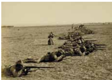
IN THE FIELD: Volley firing by a Regiment of the NSW Imperial Bushmen near Mafeking, South Africa, during the Boer War. Most of Narrandera's 27 volunteers were in the Bushmen's contingents.

South Africa was half a world away but its troubles cast a pall of gloom over Narrandera... yet nothing could prepare the district for the losses they would suffer when the world went to war just a dozen years later.