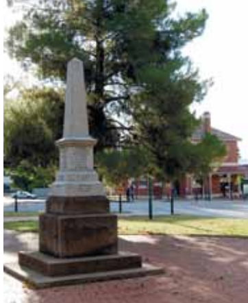
THEN AND NOW: The impressive monument erected to commemorate Narrandera's Boer War volunteers as it was in yesteryear and as it is in 2011.