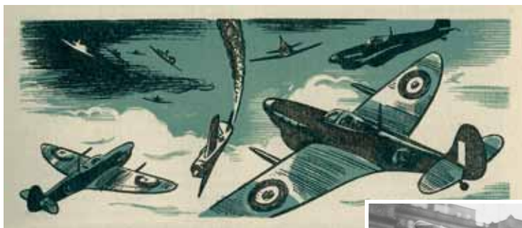
(Above) DOG FIGHT: Aerial combat over the English Channel as depicted in RAAF Saga (1944).

Across the street is the town's Returned Soldiers' Memorial Hall, established in 1936.