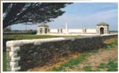
(Above) HISTORIC: The VC Corner Australian Cemetery and Memorial near Fromelles. (Top) CENOTAPH: Junee's Memorial Clock Tower. (Right) FOUND: HMAS Sydney.

Her courageous son is still yet to be positively identified ... he could well be among the as yet unidentified remains retrieved from Pheasant Wood.