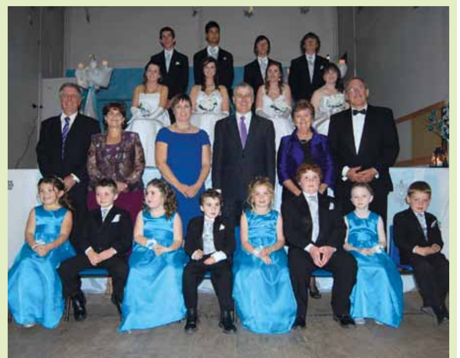
DELIGHTFUL DEBS: I had the pleasure of receiving the debutantes at the 11 June Weethalle Ball. It was a memorable evening with a wonderful turn-out from the district in the fabulously decorated Memorial Hall.

# Scheduled to be closed over next 2 years.