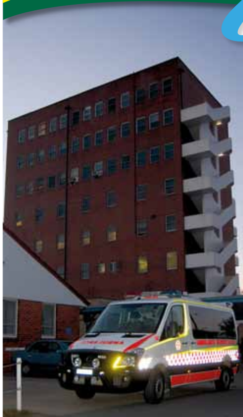
TWILIGHT: The Sun is finally setting on WWBH, opened in 1963, which will at long last be replaced.