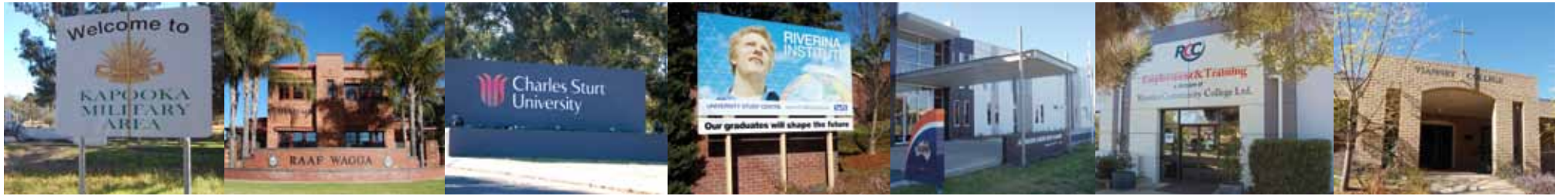
TRAINING EXCELLENCE: Some of Wagga Wagga's places of learning (from left) Kapooka Army base, Forest Hill Air Force base, Charles Sturt University, Wagga Wagga TAFE campus, REX Pilot Academy, Riverina Community College and Vianney College.