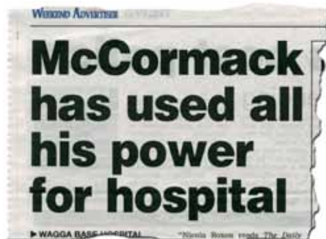
WWBH CAMPAIGN: Headline from the May 7-8 Weekend Advertiser.

If it had not been for a chance meeting a few weeks ago by our federal MP, Michael McCormack, in Brisbane Airport with Federal Health Minister, Nicola Roxon, we might have been in the $7 million bracket.