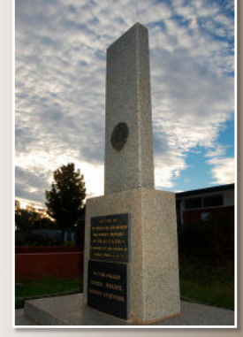
IMPOSING: Barellan's war monument.