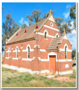
SACRED PLACE: (Above) St Stephen's at Bagdad and (Top) the plaque memorialising a pioneer minister and a brave soldier.