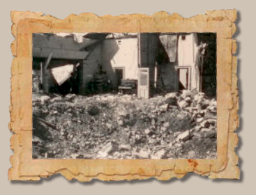
RUBBLE: A huge crater is about all which is left of the Postmaster's residence.