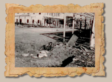
WAR ZONE: Many buildings were destroyed by the bombing raids.