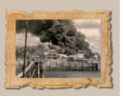
ABLAZE: Smoke billows skywards as oil tanks on Stokes Hill burn in this graphic original photograph of the Japanese bombing of Darwin.