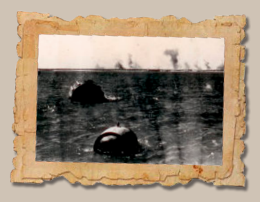
ATTACK: Darwin is pounded by Japanese fighter planes.