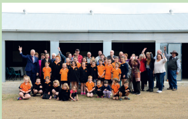
OPENING DOORS: At the opening of Nangus Hall's roller door project in which I secured $5,400 towards its completion.

I encourage locals to start thinking about potential applications. If you have a group or a public facility which needs an upgrade, or which can help boost tourism, local volunteerism or build a stronger local community, please have a look at the criteria and share your idea. My office will advise when applications open.