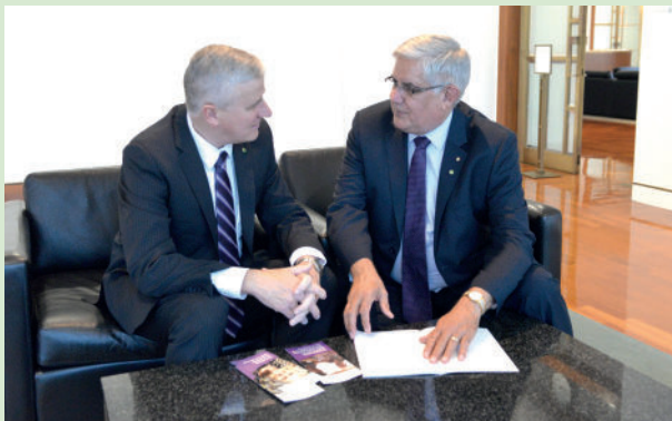
BETTER CARE: With Minister for Aged Care Ken Wyatt AM.

The measures we are taking in the aged care sector means an improved quality of care which respects the dignity of older Australians and supports their independence.