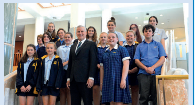
MARBLE LESSON: With Gundagai High School students during their visit to Parliament House.

This initiative will ease this pressure.