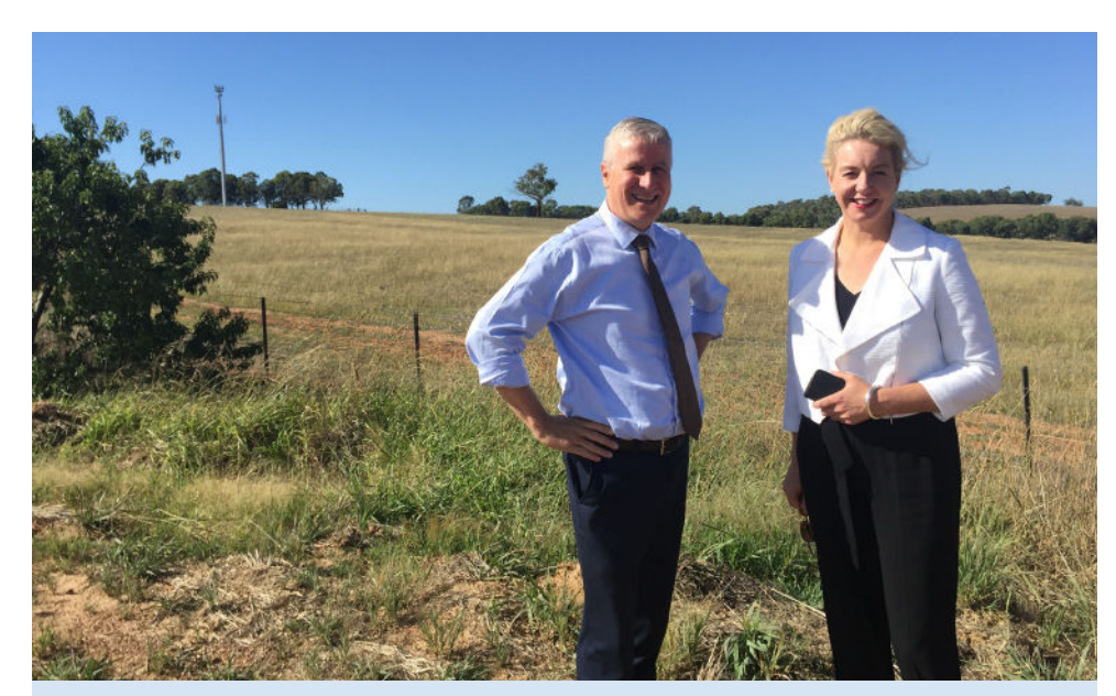
BETTER RECEPTION: With Deputy Leader of The Nationals and Minister for Regional Communications Bridget McKenzie at the Ladysmith mobile phone tower delivered under the Mobile Black Spot program.