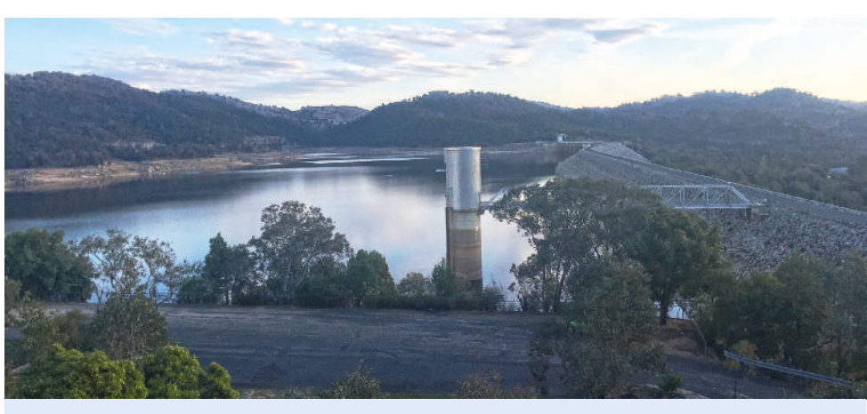
STORAGE BOOST: The height of the Wyangala Dam wall, near Cowra, will be raised from 85 metres to 95 metres.