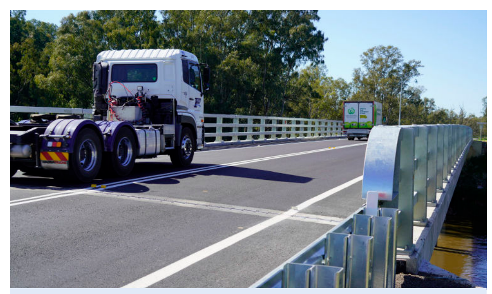
UNLOCKING POTENTIAL: The newly upgraded Eunony Bridge near Wagga Wagga will play an important role in the transport of freight to and from the future Riverina Intermodal and Freight Logistics Hub and its connection to the nation-building Melbourne-to-Brisbane Inland Rail.