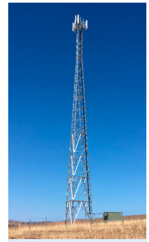
DELIVERING: The Nationals have helped to deliver more than 880 base stations across the country through the Mobile Black Spot Program, including this one at Wantabadgery.

The network investment plan includes $3.5 billion to make NBN Co's highest wholesale speed tiers available, on demand, to up to 75 per cent of homes and businesses on the fixed-line network by 2023. Additionally, NBN Co will invest $700 million to enable nine in 10 businesses to order highspeed fibre broadband at no upfront cost as NBN Co rolls out 240 Business Fibre Zones across Australia, 85 of which will be located in the regions, including at Wagga Wagga.