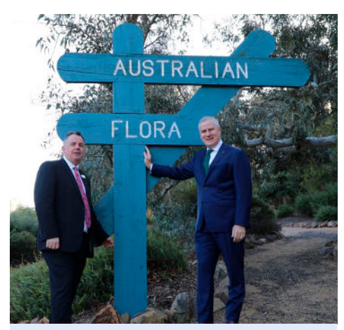
POPULAR TOURIST SPOT: With Wagga Wagga Deputy Mayor Dallas Tout after announcing the Botanic Gardens was to receive $4,288,879 in Federal Funding for the Botanic Gardens Precinct Renewal project.

This round will complement other actions the Government has taken to support regional tourism through the Relief and Recovery Fund as well as the $50 million Regional Tourism Recovery initiative.