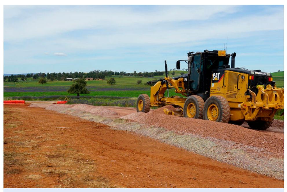
GETTING ON WITH THE JOB: Early works have already started for the Parkes bypass on Nock Road, just north of the town.

The Parkes Bypass is great news for locals, for businesses and for the future of the region, with many communities, farmers and businesses across the Central West, Murrumbidgee Irrigation Area and western NSW relying on the highway to get their products to shelves, remain connected to jobs and vital services, such as health, and