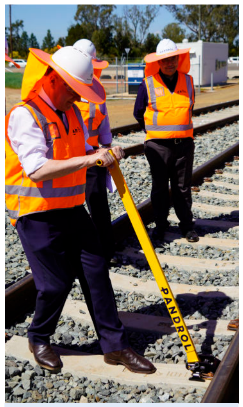
MOMENTOUS: Putting the final pin in place at Peak Hill to mark the completion of the Parkes to Narromine section of the Inland Rail. INSET: The gold commemorative pin.